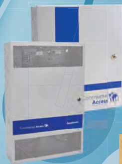
Full-Range, Super Fast Expandable Controllers