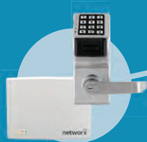
Wireless Network Networked Locking