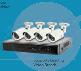
Supports Leading Video Brands