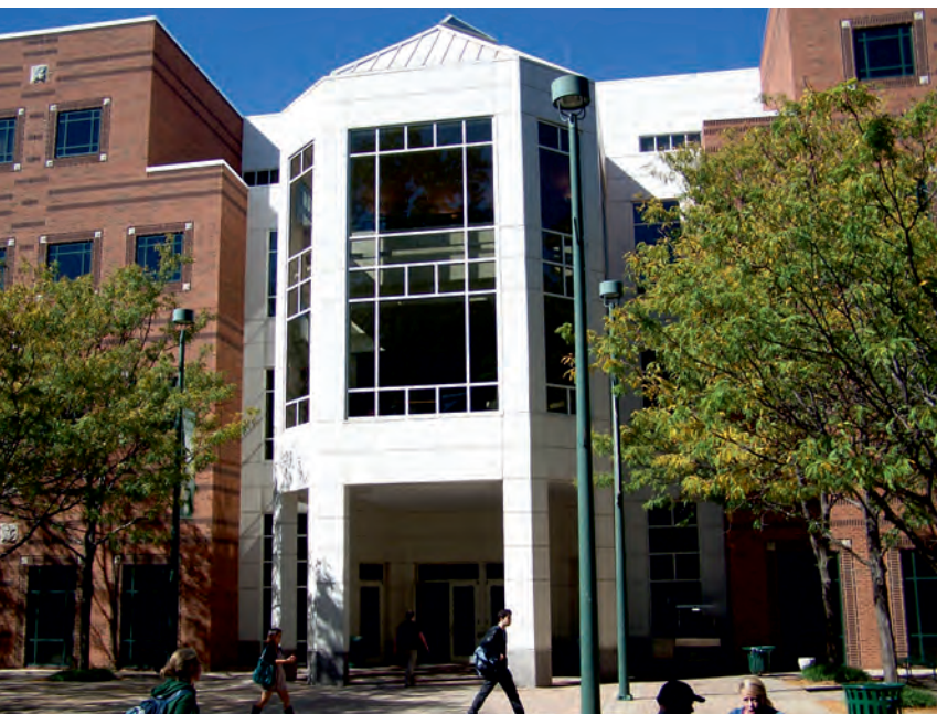
The Johnson Center is one of three student centers at George Mason University in Fairfax, Virginia.