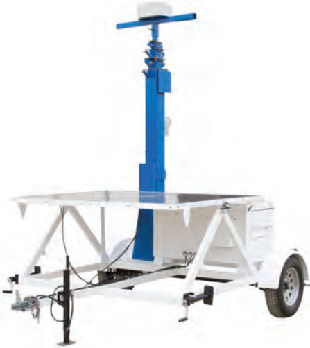
Larson Electronics' solar light tower (SPLT-.53K-LM30-2XN3B-PW-TLR7) is the ultimate solution for security monitoring in remote locations.

Security for remote locations with limited access to the grid, such as open fields, makeshift concert venues and outdoor events, can be difficult to implement without adequate lighting. The presence of solar light towers may prevent criminals from exploiting poorly lit sections in the applicable area, and provide a safe environment for children and other members of the community.