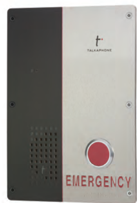
VOIP-600E: York College elected to install new Talkaphone VOIP-600E in their existing housing