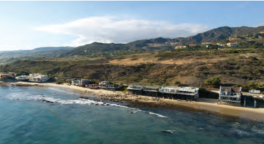
Pepperdine University's beautiful 830-acre campus overlooks the majestic Pacific Ocean.

Perched high atop Malibu, CA, Pepperdine University's beautiful 830-acre campus overlooks the majestic Pacific Ocean. The esteemed private Christian University's well-known standard of excellence applies as much to its student body, of nearly 8,000, as it does to security for its aesthetically appealing facilities, dormitories, and grounds. "After an exhaustive and competitive product vetting and bid effort, we selected Continental Access's Wireless Trilogy Networx Locks for student residences throughout the campus... as part of an important Safety Initiative," a Pepperdine University VP said, recapping the first-phase installation 3 years ago.