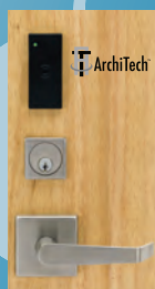
Customizable Architectural Wireless Access Locking