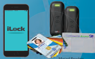
Myriad Readers, Credentials & Mobile Access Bluetooth App