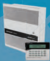
Napco Gemini Security Systems