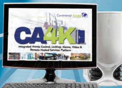
Scalable, Enterprise Class, IT-Friendly Platform