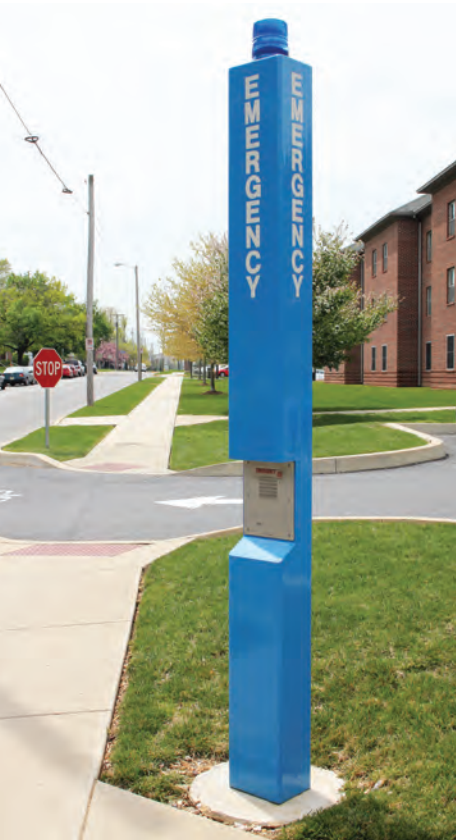
Talkaphone ETP-MT tower with original analog phone installation on campus.

At York College of Pennsylvania, the campus safety and IT departments teamed together to switch their existing analog phone station and IP converters over to native VOIP call stations. Both departments at the 190-acre suburban campus adjacent to York, PA saw a need to move their existing analog lines over to VOIP call stations.