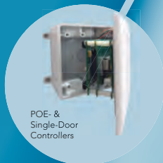
POE- & Single-Door Controllers